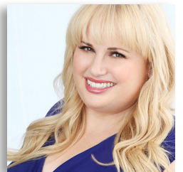
Rebel Wilson Universal Pictures Pitch Perfect