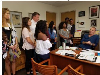
Students at office of Casting Director from General Hospital