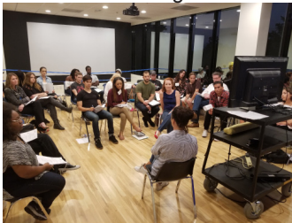
Meeting with LA Talent Agents