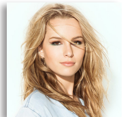
Bridgit Mendler Disney Channel Good Luck Charlie