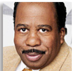
Leslie Baker Series Regular The Office

SAMPLE COURSE OVERVIEW BASED ON PREVIOUS PROGRAMS EIGHT TO TEN HOURS PER DAY - ALMOST 50 HOURS OF COURSE WORK