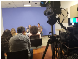
Students at 'On Your Mark' Casting