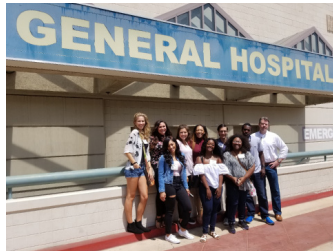
Touring the set of ABC's 'General Hospital'