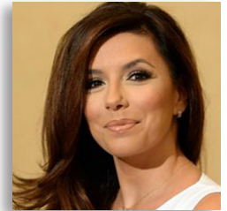
Eva Longoria ABC Desperate Housewives