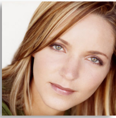
Jordana Spiro Fox The Mob Doctor