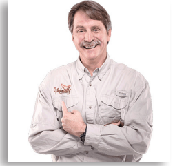
Jeff Foxworthy FOX TV Smarter than a 5th Grader?