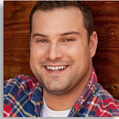
Max Adler Developing the Actor Actor in the Feature Film "Sully" Series Regular "Glee"