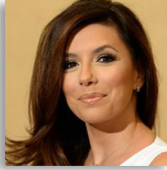
Eva Longoria ABC Desperate Housewives