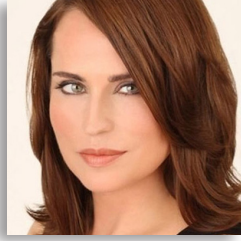
Crystal Chappell CBS The Bold & The Beautiful