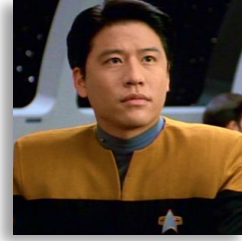
Garrett Wang UPN Star Trek: Voyager