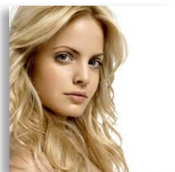
Mena Suvari Dreamworks Pictures American Beauty