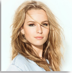
Bridgit Mendler Disney Channel Good Luck Charlie