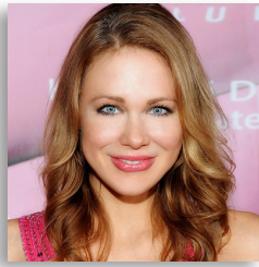
Maitland Ward Disney Channel Boy Meets World